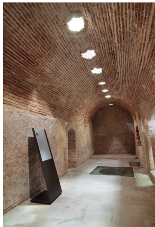
↑ Cold room.