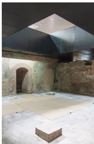
↑ Entrance hall (vestibule) to the Baths.

Here bathers undressed and were given towels, soap, sponge, wooden stilts so as not to burn their feet and a couple of wooden buckets. On the current floor you can see remains of the original brick and stone flooring ( jabaluna ), as well as of the darro 2a or atarjea that drained the dirty water from the inside of the baths to the gully that ran alongside the building (now Calle del Agua). Also preserved are the brick jambs 2b of the original door that gave onto the street, from the time the baths were in use, between the 13th and 16th centuries.