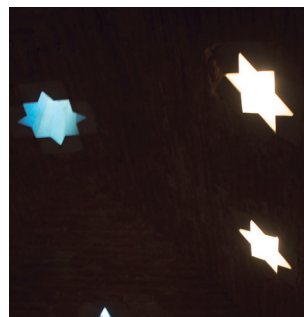
← Details of the skylights. ↓ Warm room. ↓ Detail of the vaulted ceiling of the baths' warm room.

Agencia Andaluza de Instituciones Culturales CONSEJERÍA DE CULTURA Y PATRIMONIO HISTÓRICO