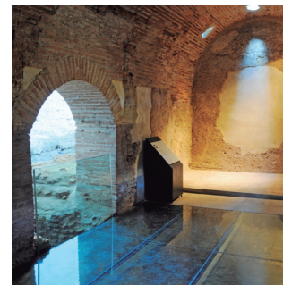
↑ Hot room.

of the fire from the adjoining furnace, the smoke produced by the burning of fuel being evacuated by means of four chimneys 5a whose openings were in the corners under the floor. The room had two alcoves at the ends 5b similar to the ones in the cold room. The bathers scooped up the almost boiling water from the boiler and poured it over their body, producing large amounts of steam. They then splashed themselves with cold water on an alternating basis, which was the whole point of the bath. They would be assisted by a servant or bathsmen ( kiyassa for men and tayabaste for women) who would lather and scrub them vigorously.