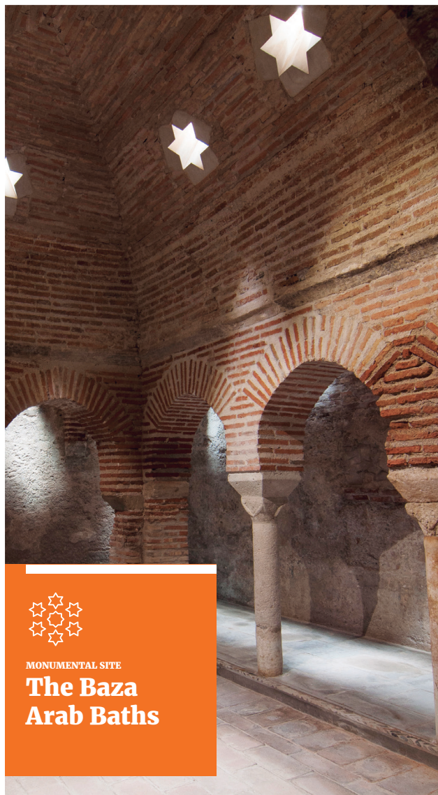
↑ Warm room ( al-bayt al-wastani ) of the Baza Arab Baths.